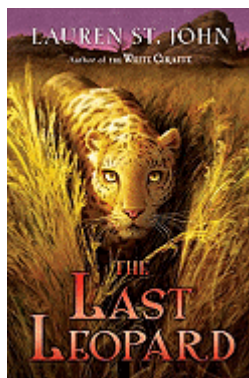
The Last Leopard Lauren St. John

Martine can't wait to spend the school vacation riding her white giraffe around the Sawubona wildlife reserve with her friend Ben. But when her grandmother gets a distressed call from an old friend her hopes are dashed. They must all travel to Zimbabwe, where local legend says that the last resting place of the king of leopards is the hiding place of a treasure. Martine and Ben must find and protect Khan, the last leopard in the Matobo Hills, from the poachers and treasure hunters who will stop at nothing to discover if the legend is true. This heart-pounding companion to "The White Giraffe" and "Dolphin Song" brings Martine even closer to her own destiny as the child who has power over all the animals.