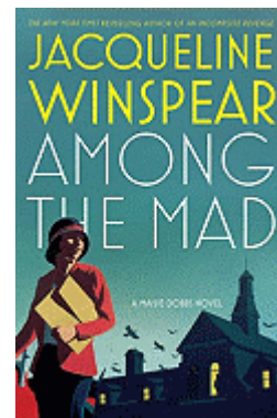
Among the Mad Jacqueline Winspear

Detective Maisie Dobbs, in her fourth appearance in this delightful and popular series, must catch a madman before he commits murder on an unimaginable scale.