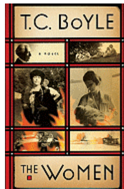
The Women T.C. Boyle

Is it easy to live with a genius? Find out in this fictional account of the outlandish character of Frank Lloyd Wright, told through the tempestuous experiences of the four women who loved him.