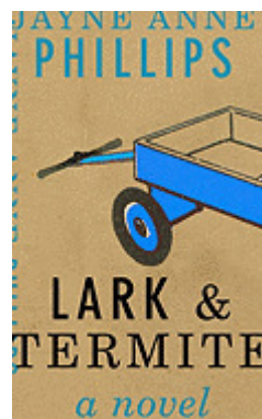
Lark & Termite Jayne Anne Phillips

Aspirations and family ties play out across three generations of the Khalil family in Farooki's fine new novel (after " Bitter Sweets "). As the characters make inroads on their ambitions, the cross-purposes of their desires and responsibilities threaten to crush the family. A flawed yet likable cast question what, exactly, leads to a more