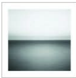
No Line on the Horizon U2

Click on "reserve" to open the library catalog and reserve a copy.