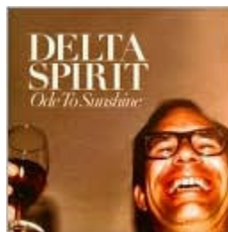
Ode to Sunshine Delta Spirit

Diana Krall doesn't disappoint with another quintessential Diana jazz album. Her sensual vocals