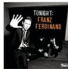
Tonight Franz Ferdinand

Get ready to dance with the latest from Scotland's rock group Franz Ferdinand. With songs like Ulysses and No You Girls , you won't be able to sit still.