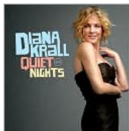
Quiet Nights Diana Krall

Diana Krall doesn't disappoint with another quintessential Diana jazz album. Her sensual vocals