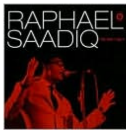
The Way I See It Raphael Saadiq

Some of you may remember Raphael Saadiq as the lead vocalist and bassist for Tony! Toni! Tone! Well, he's back with a Grammy nominated album. This album has a vintage sound that makes you think it could have been around thirty years ago! It's full of amazing motown songs, including Sure Hope You Mean It , Just One Kiss , Love That Girl , Keep Marchin' , and Oh Girl . Think modern Temptations!