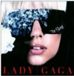
The Fame Lady Gaga

Click on "reserve" to open the library catalog and reserve a copy.