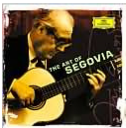
The Art of Segovia