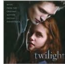
Twilight Original Motion Picture Soundtrack

This compilation spent 12 weeks on the Billboard Top 10 and sold over 1.3 million copies. The music for the movie distinctly set the background and mood for Edward and Bella's unfolding romance. Highlights include songs from Muse, The Black Ghosts, Blue Foundation, Rob Pattinson (who portrays Edward in the movie), Iron and Wine and Carter Burwell's instrumental piece "Bella's Lullaby." Also available at the library is "Twilight: the score." Go ahead, go into the Twilight.