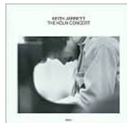
The Koln Concert Keith Jarrett