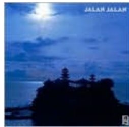
Bali Jalan Jalan

Bali is a mostly instrumental album by the Japanese group Jalan Jalan. The songs are written in canon form, which creates a beautiful rhythm and flow to the music. Bali is infused with the sounds of nature (listen for the calming sound of crickets) and relaxing beats. Great tracks include Lotus , Sunset and Firefly Sanctuary , which contains melodic bells and flutes. Close your eyes, take a whiff of the incense sticks that are located in the CD case, and you'll be whisked away to Bali.