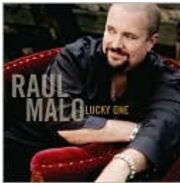
Lucky One Raul Malo

You might recognize Raul Malo as the former leader of the Grammy winning country group the Mavericks. Lucky One is the first album of original songs in seven years by the artist and it doesn't disappoint. Malo's voice is amazing and has a striking resemblance to Roy Orbison and Chris Isaak. Malo's eclectic sound includes a mix of vintage rock, country, jazz and Latin music that will keep you listening to hear what's next. Try Moonlight Kiss for a touch of swing.